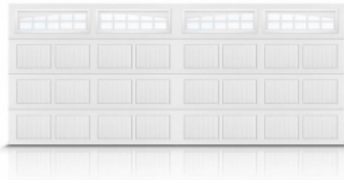
2 Car Carriage House