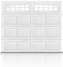
1 Car Carriage