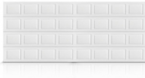
2 Car Colonial