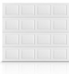
1 Car Colonial