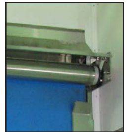
Hinged drip guard lifts up for easy cleaning